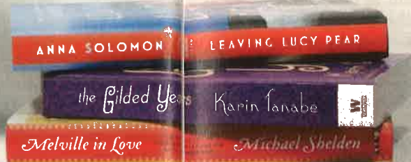
JOHN STEINBECK IS A CHARACTER IN THIS NOVEL